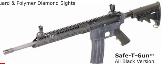
Safe-T-Gun™ All Black Version