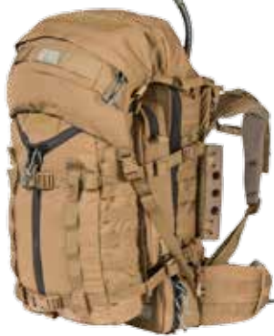
COMM 3 2500 cu-in (sustainment) pg 14