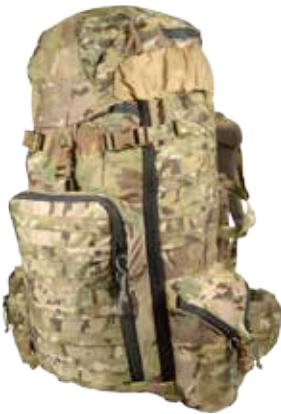
ROUS 3300 cu-in pg 13