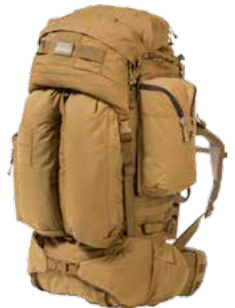
TACTIPLANE 6000 cu-in pg 7