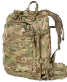
CREW CAB 1900 cu-in + overload pg 11