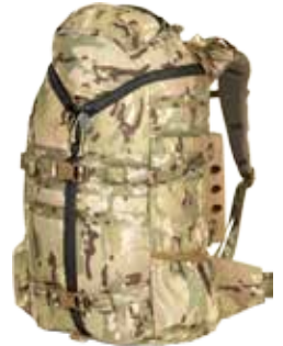
KOMODO DRAGON 2300 cu-in pg 5