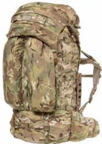
6500 6500 cu-in pg 9