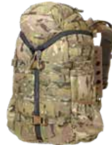
3 DAY ASSAULT 2000 cu-in pg 4