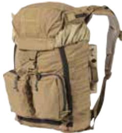
RATS 1800 cu-in pg 12