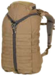
ASAP 1120 cu-in pg 5