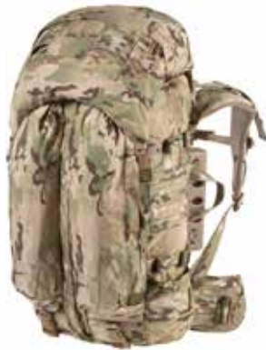
SATL 3650 cu-in pg 6