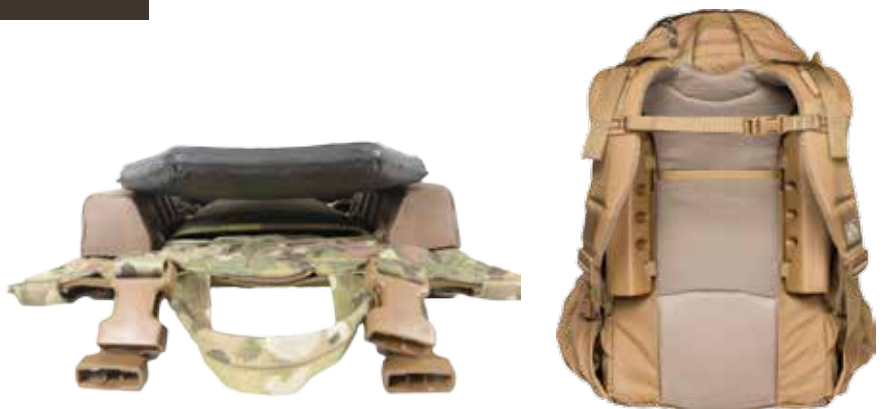
TOP DOWN VIEW OF PLATE ON BVS BODY PANEL

Our Bolstered Ventilation and Stability (BVS) system works by stabilizing the pack across your back, preventing the pack from rolling across the plates. The bolsters are made of durable, molded EVA foam and mount to the sides of the pack frames. When missions don't require armor, the bolsters are removable.