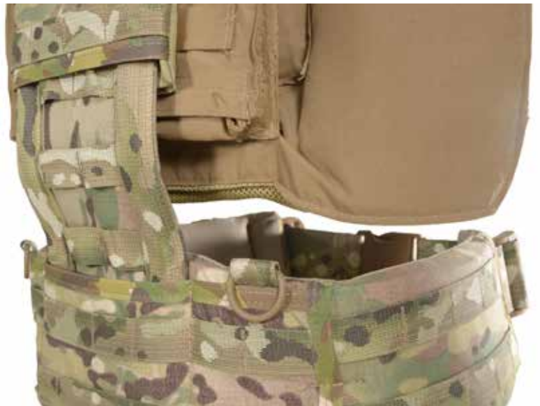
CURVED STAYS ACCOMMODATE PLATE VOLUME