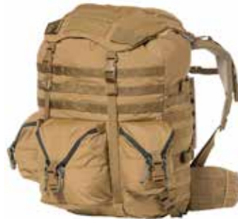
MOUNTAIN RUCK 5300 cu-in pg 8