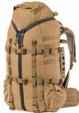
OVERLOAD 3000 cu-in + overload pg 10