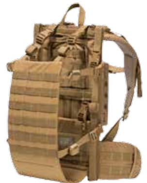
LOAD SLING NA cu-in pg 11