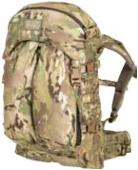
DATL 2300 cu-in pg 15