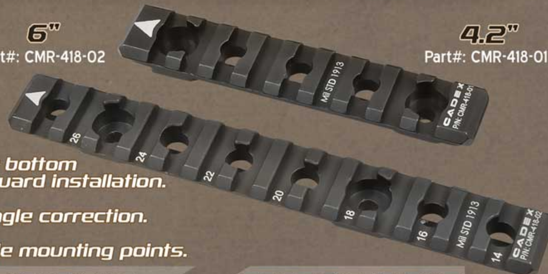
4.2" Part#: CMR-418-01