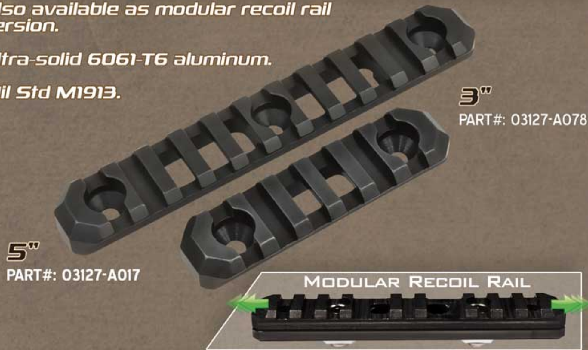
5" PART#: 03127-A017