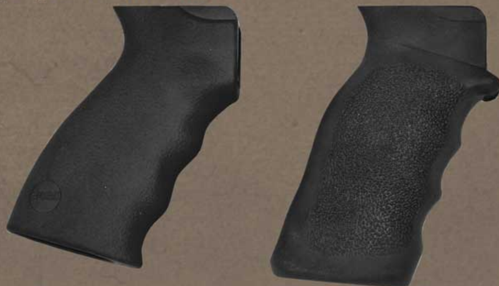
SMALL PART#: 175-00023