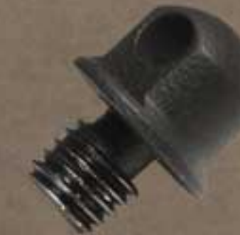
STUD 1/4-28 Part#: 03127-321

* DESIGNED AND PRODUCED BY CADEX INC, EXCLUSIVITY OEM TO VIKING TACTICS.