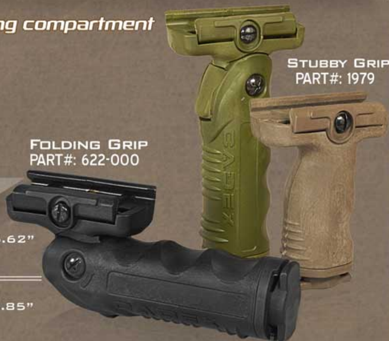
STUBBY GRIP PART#: 1979