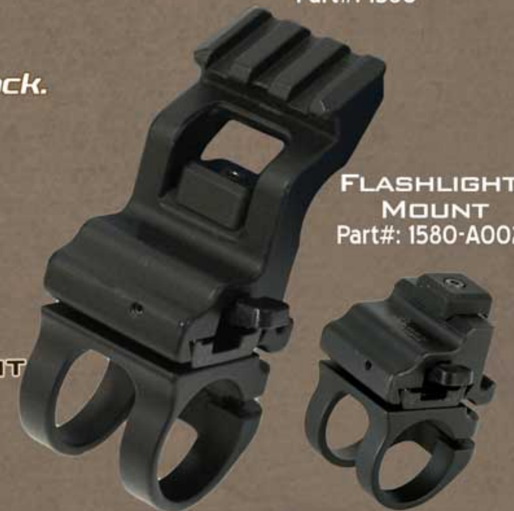
FLASHLIGHT MOUNT Part#: 1580-A002