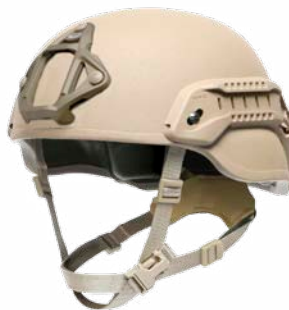
TBH-II-HC (Headset Configured, Mid-Trim)