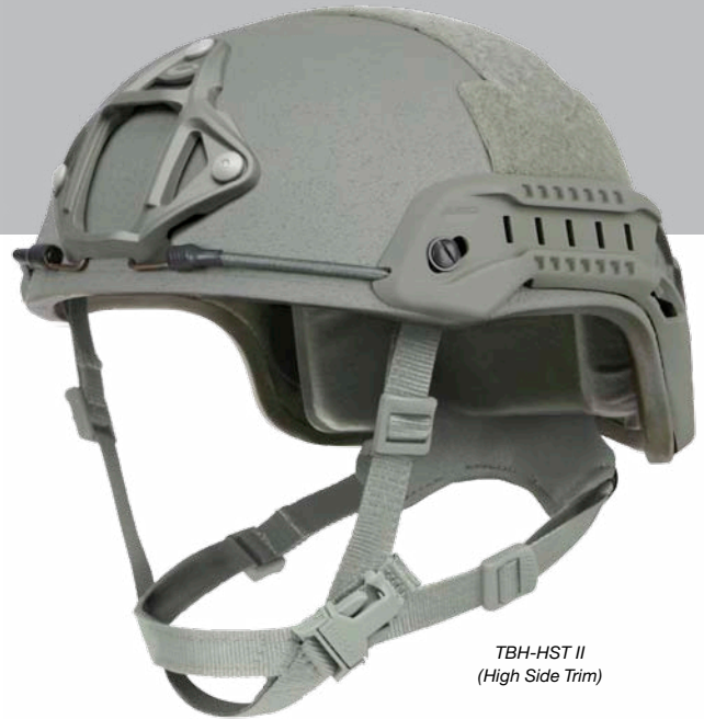
TBH-HST II (High Side Trim)

The Gentex TBH-II MC family of helmets are NTOA approved for law enforcement and conform to the performance requirements of U.S. Army specifications PS-0428, including the NIJ IIIA 9mm FMJ protocol.