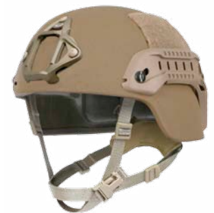
TBH-II (Standard, U.S. Army)