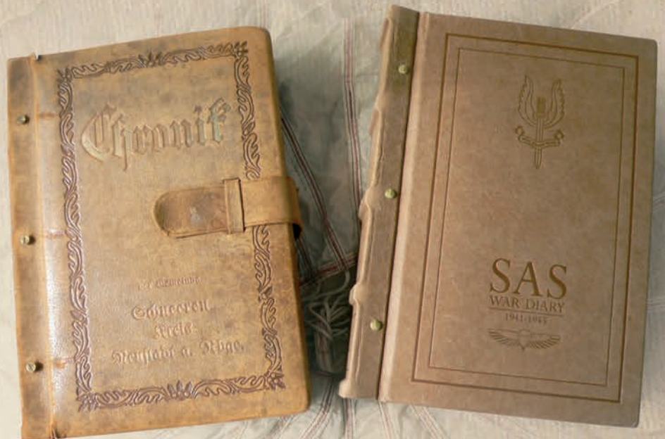
The Original Diary

Each page has been individually scanned and converted to a high quality digital file, as has the material from the Association archive. This digital artwork has been printed on heavyweight archival-quality acid-free paper, especially made for the project in order to replicate the original pages as closely as possible. The original documents, photographs and maps are therefore reproduced in full size and in stunning clarity.