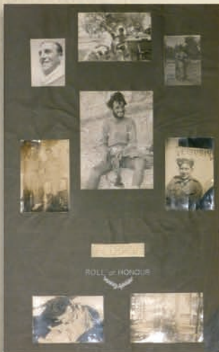
Page of the original Diary

But the soldier did something else. He collated his work in a single massive war diary, measuring 17" x 12" x 4" and weighing over 25 lbs, and bound it in leather "liberated" from Nazi Germany.