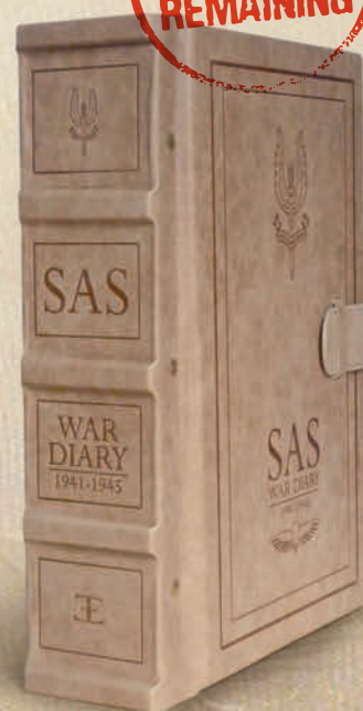
The Signed Editions

The Diary is being published by Extraordinary Editions Limited, in association with SAS Regimental Association Publishing Limited, who have retained full editorial control. The lion's share of the profits will go towards the welfare work of the Regimental Association. The team at Extraordinary Editions have many years of experience in producing hand made facsimile books of heirloom quality. Production, printing and binding all take place in Great Britain.