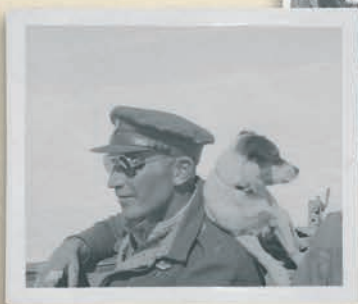
Paddy Mayne, 1945