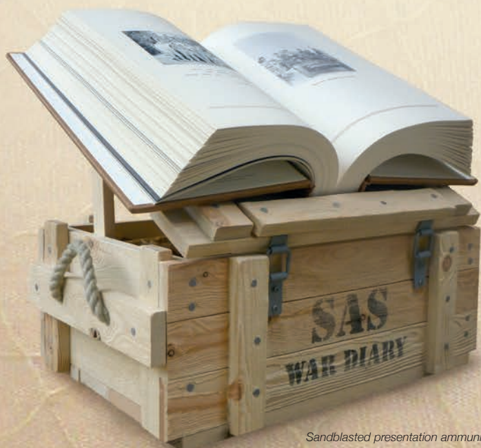
Sandblasted presentation ammunition box

The Victoria Cross and Originals Editions both come in a sandblasted presentation ammunition box which is lined in parachute silk. The box doubles as a lectern for reading and display purposes [illustrated]