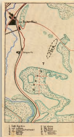
Map from the original Diary

MEMORANDUM BY COLONEL DAVID STIRLING, DSO, OBE ON THE ORIGINS OF THE SPECIAL AIR SERVICE REGIMENT