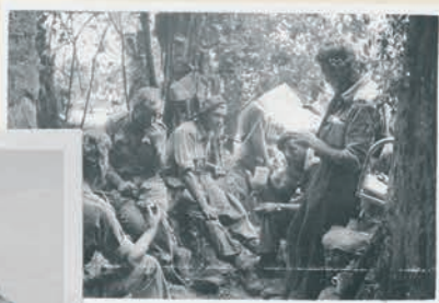
Briefing behind the lines

Limited to 1000 copies available for £975 plus delivery