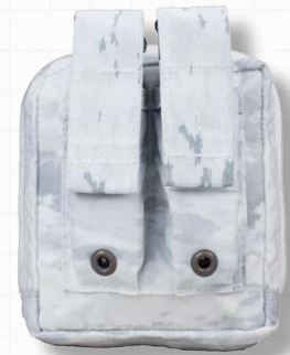
GP Pocket w/ Pistol Pockets, ATACS ATX