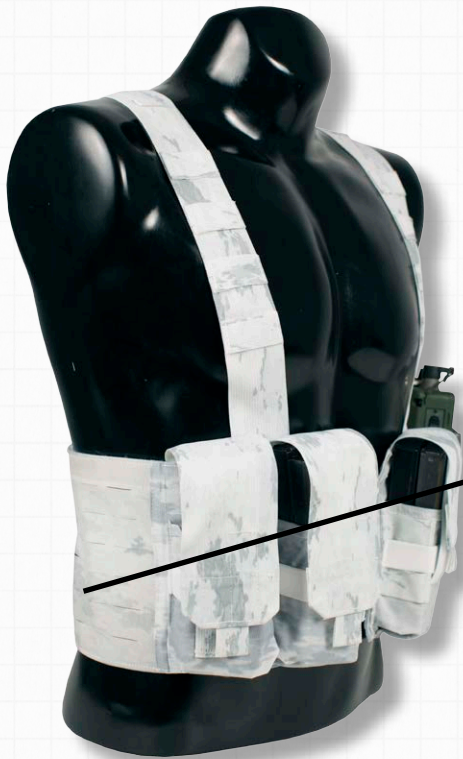
6/12™ Modular panels on both sides