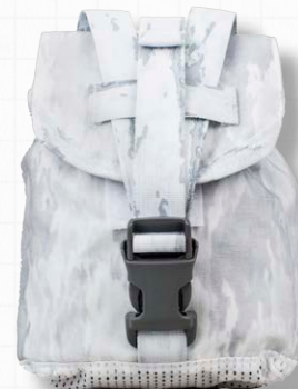
Arctic Canteen Pocket, ATACS ATX