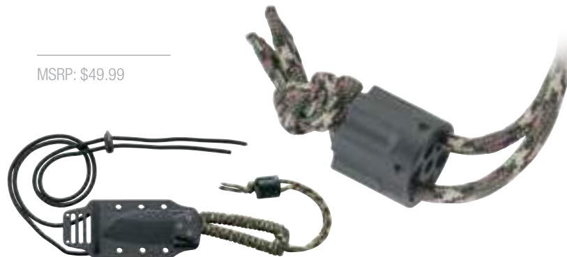
Sheath: Multi-Position Injection Molded Nylon Sheath Weight: 1.3 oz. (37 gm)